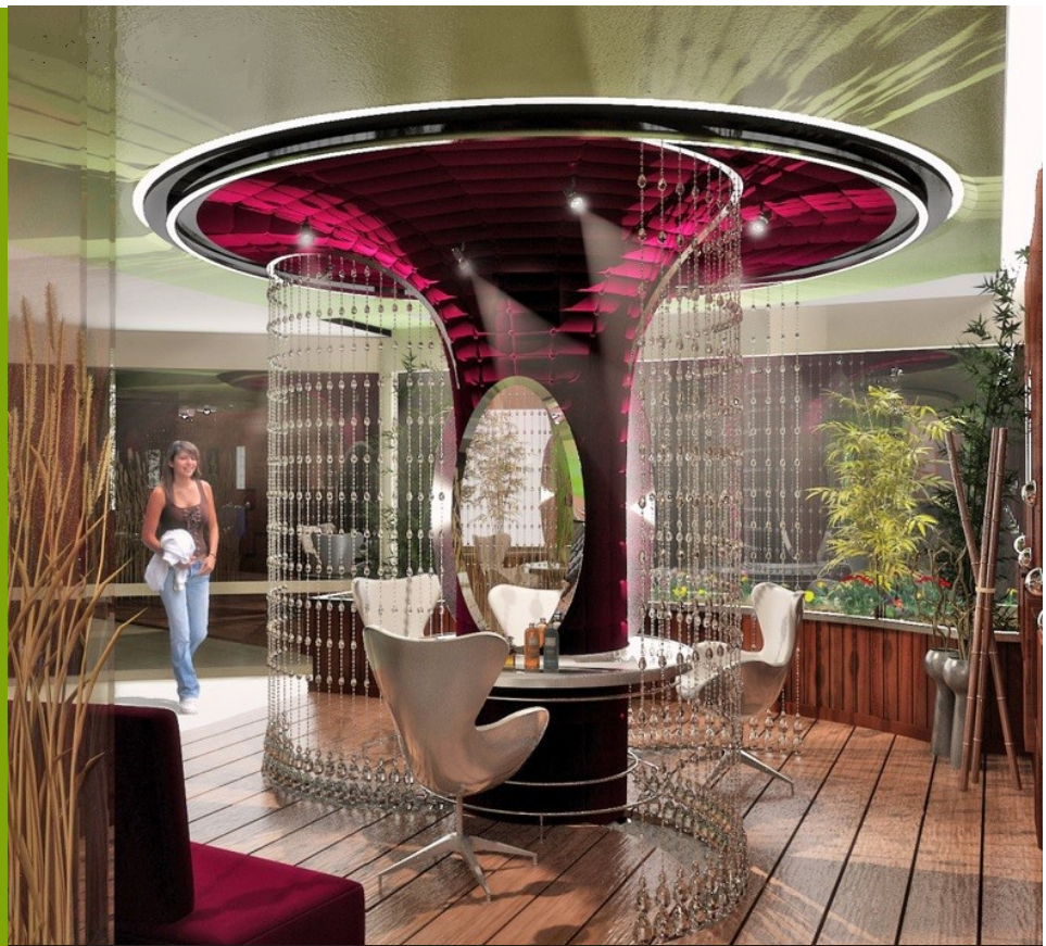
Sustainability in the future Green Salon

During this project we will develop an internet game to raise awareness on sustainability. It will be used in the VET-schools and is free available on the internet. The game will be focused on the green salon. It will show several workspots in a salon. In each workspot you can find questions on sustainability you can answer. The questions are about the several aspects of sustainability.