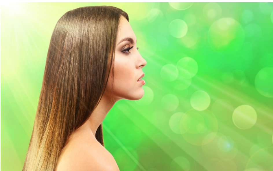
Sustainability in the hair & beauty sector

Central in this project is the fact that the project tries to transfer the ideas and knowledge on sustainability through information, education and training to students, schools, employers, employees and other stake-holders in the Hair and Beauty (H&B) sector'.